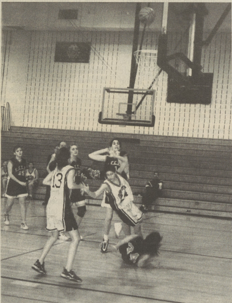
More good play ahead for the women's team? We will have to wait and see.

Key match-ups for this team are PSU Hazelton, who return most of their starters and PSU Scranton, who are the defending league champions.