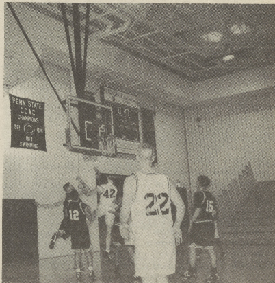
What will this season hold for the men's basketball team?