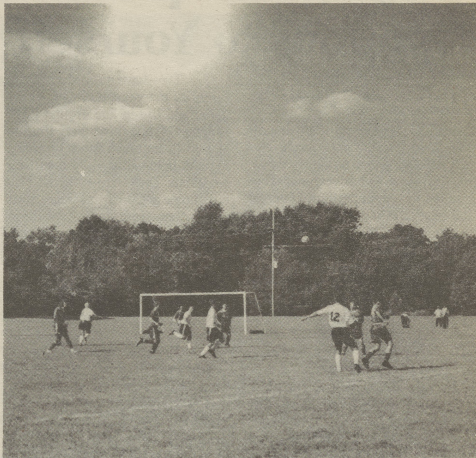
A beautiful day is the backdrop for another exciting soccer match.

It seems that every day more and more people are participating in the game. So with all of this hard core wall ball playing going on, I want to know when the championships are going to start? Just remember that it's all about style baby!