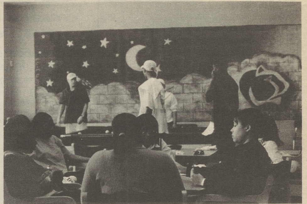
A relaxing game of cards.