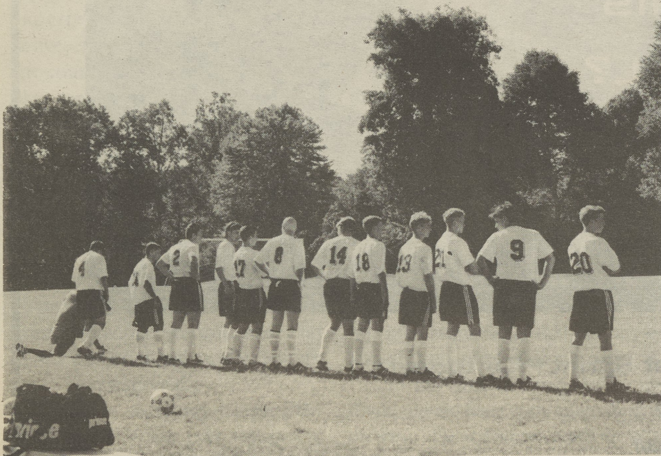
The soccer team patiently waiting for their game and number 8 wonders if he should have put sunscreen on his head.