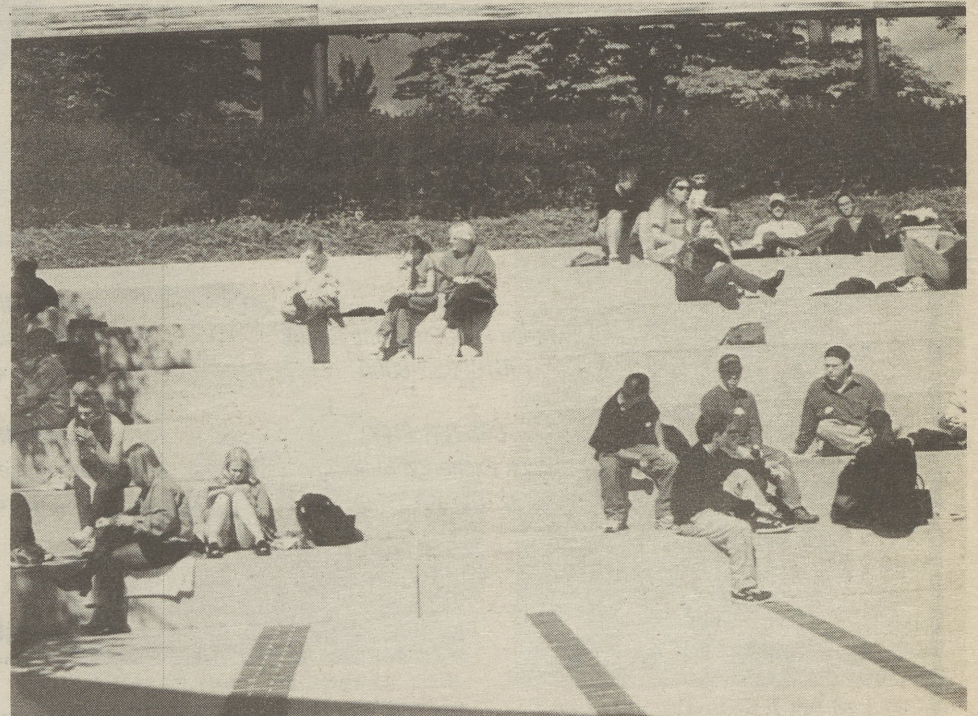
A sunny day for philosophizing.