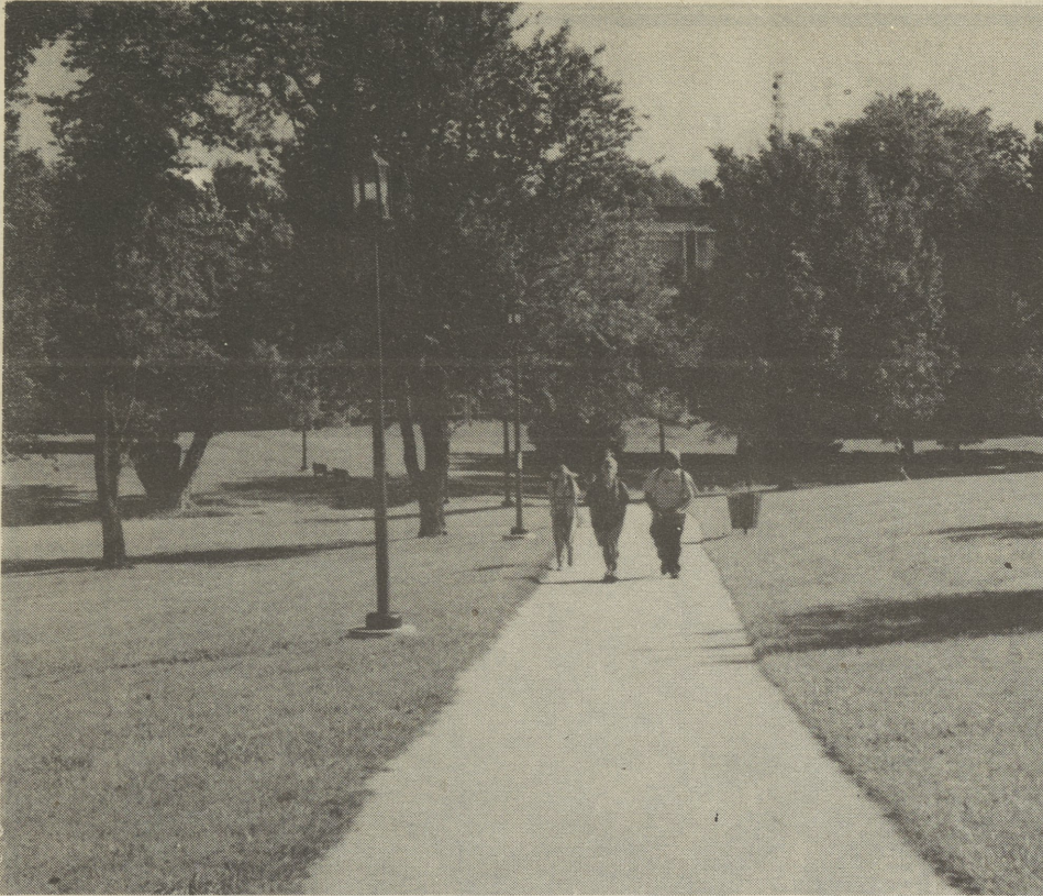
A great day for a college stroll.