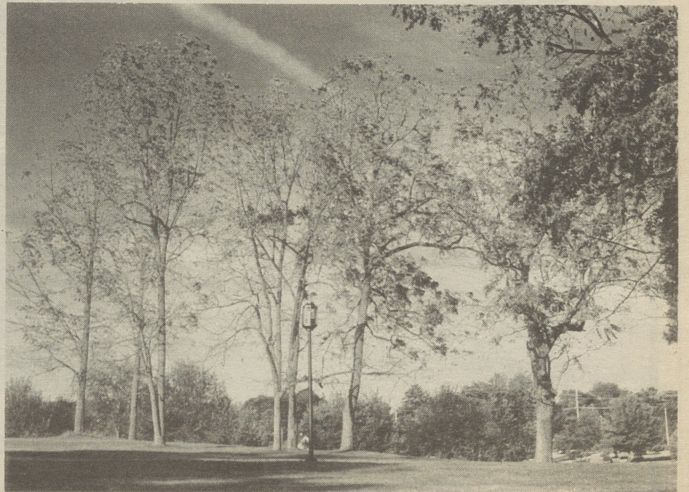
Our beautiful Penn State green.