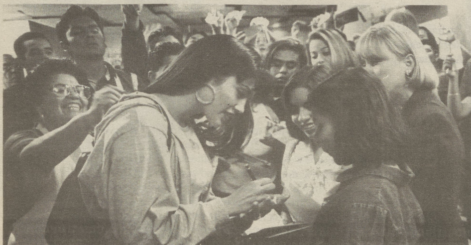
Late teen phenom Selena Quintanilla played by Jennifer Lopez in Gregory Nava's "Selena."

El Norte , a film on Guatemalan refugees who endure hardship attempting to cross the U.S. border was one of the first films to address the issues of the immigrant experience. He received an Academy Award nomination as well as establishing himself as a versatile writer/director and earning him critical acclaim on his other projects Mi Familia and recently Selena . Both portray the Mexican-American family, Selena focusing more on the slain artist Selena Quintanilla. Nava, who does college circuit speaking along with his Film career, also manages affairs at the Independent Features Project West which he co-founded with his wife. Recently Nava directed "When Fools Fall in Love," which depicts the love triangle of 50's teen sensation Frankie Lyman. He will be speaking on Nov. 18 at 12:30 p.m. in the Main Student Lounge.