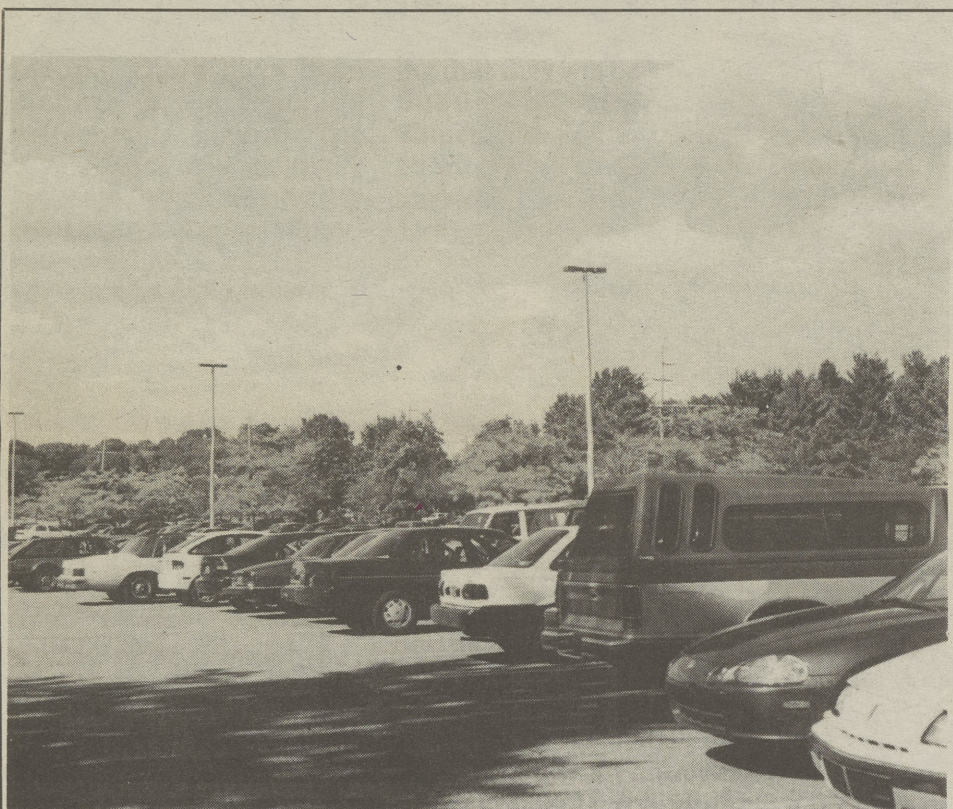
Freshmen, ever hear of car pooling?

Universities and colleges have in the past and will continue in the future to use rankings to place students in perspective, so why not rank the rankers? The survey itself as U.S. News explained, is meant to be a guide...so use it wisely.