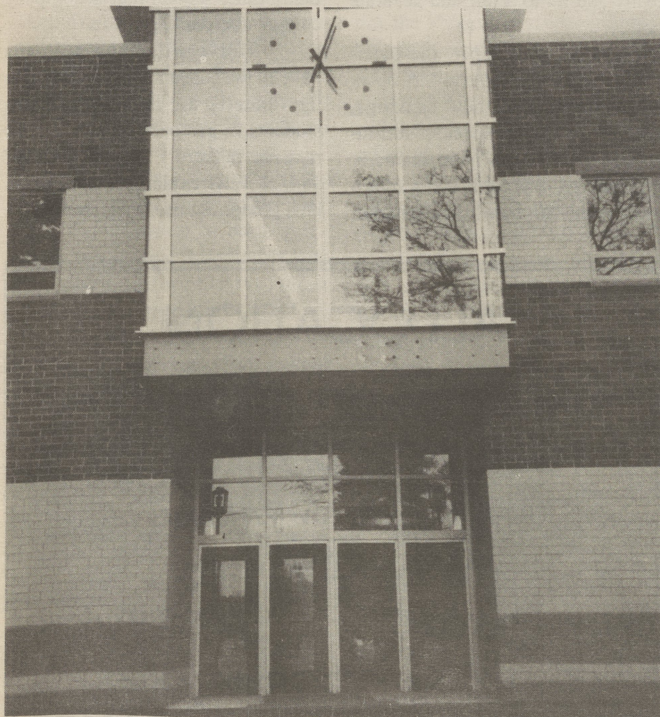
It's almost time for the new building to open.

Directly through the entrance doors, will be the student lounge, decked with couches. There are floor to ceiling windows on two sides that look out onto a wrap-around patio and the woods beyond.