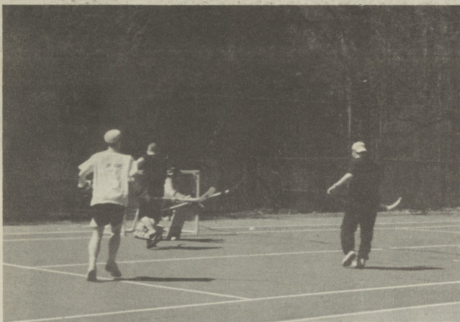
The action is fast and furious at the intramural hockey games.