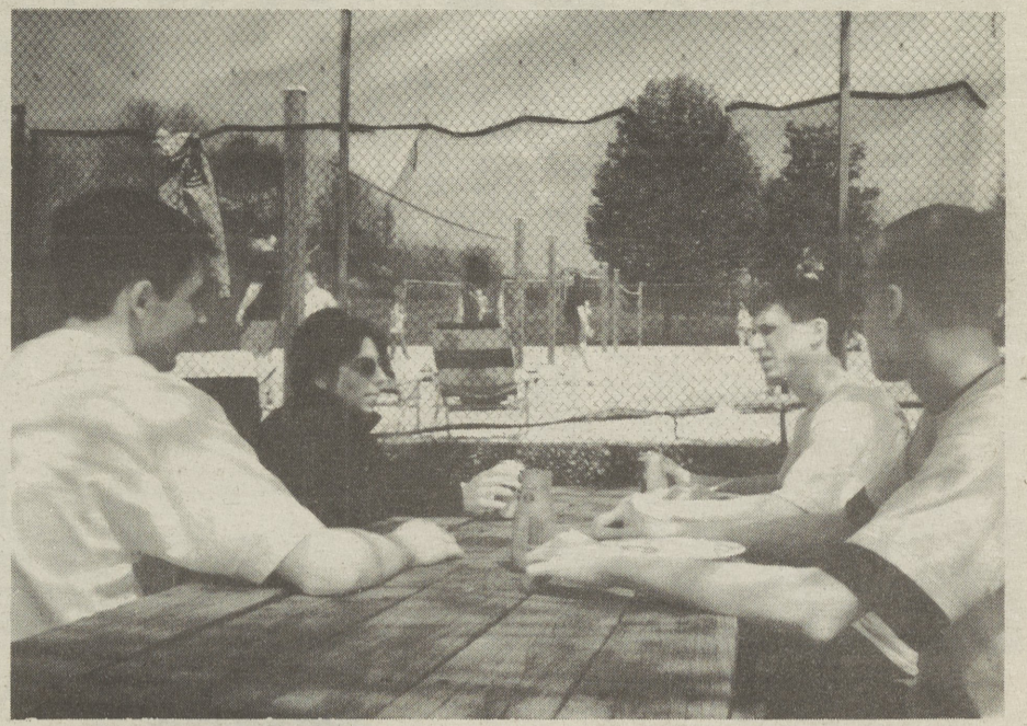
Participants in the Alumni Volleyball Bash relax as others battle it out on the sand.