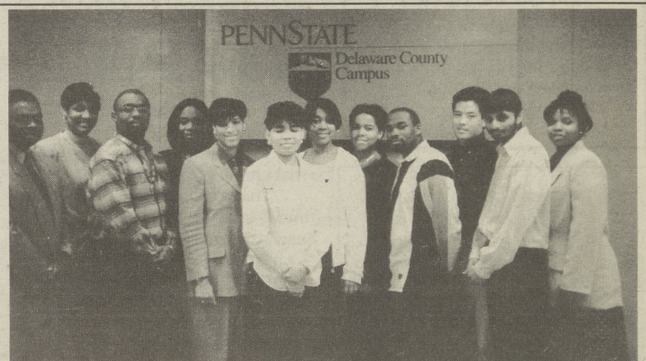
Penn State alumni and area professionals pose with Delco students after their recent Empowerment Luncheon.