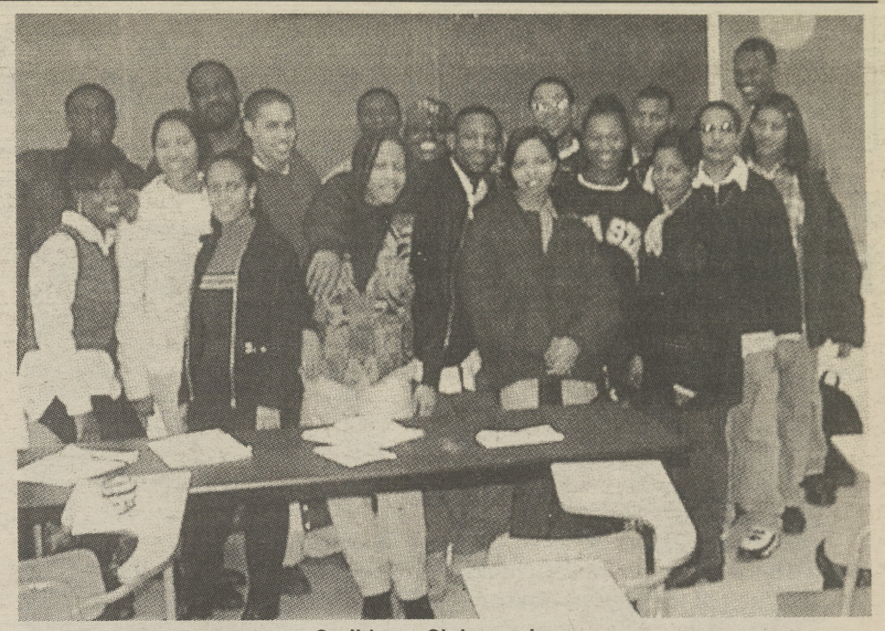
Caribbean Club members.