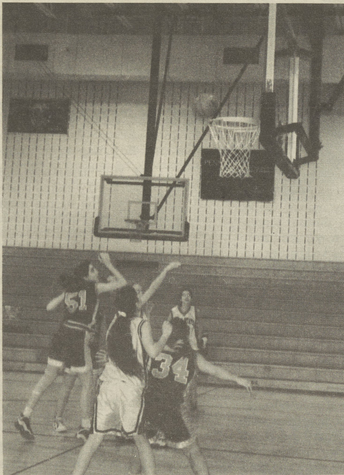
Penn State takes a shot.