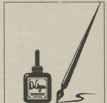
Penn In Hand

The next time a professor appears to be absent minded, consider the fact that the great American novel may be brewing in his or her mind.