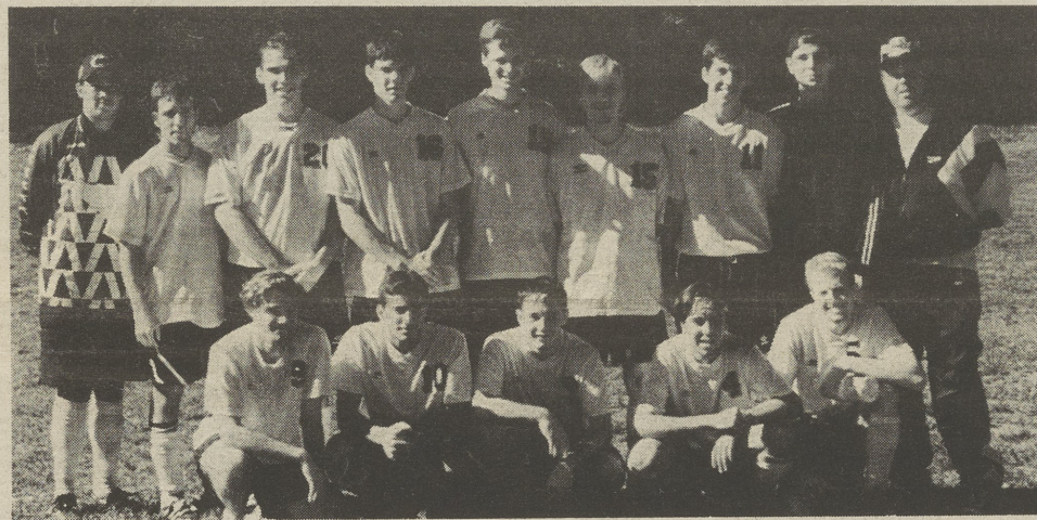
Delco's soccer team, made up of mostly younger players, fought hard through a tough season.