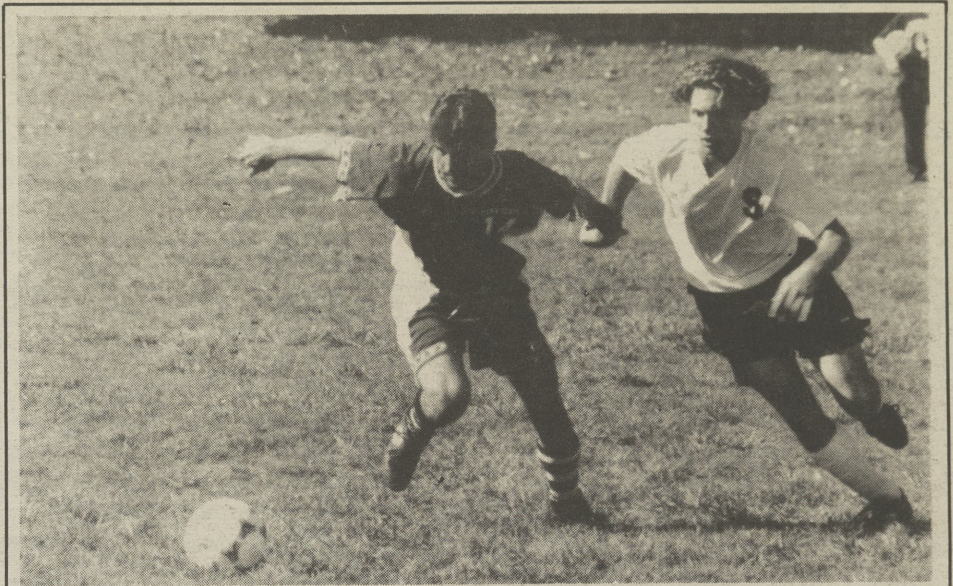
Penn State Delco aggressively competes against Abington in a strenuous match.