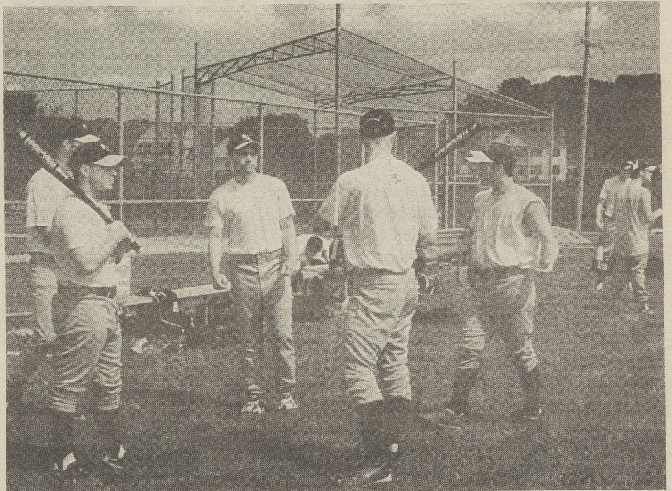
Delco players prepare for their game against PSU Mont Alto.