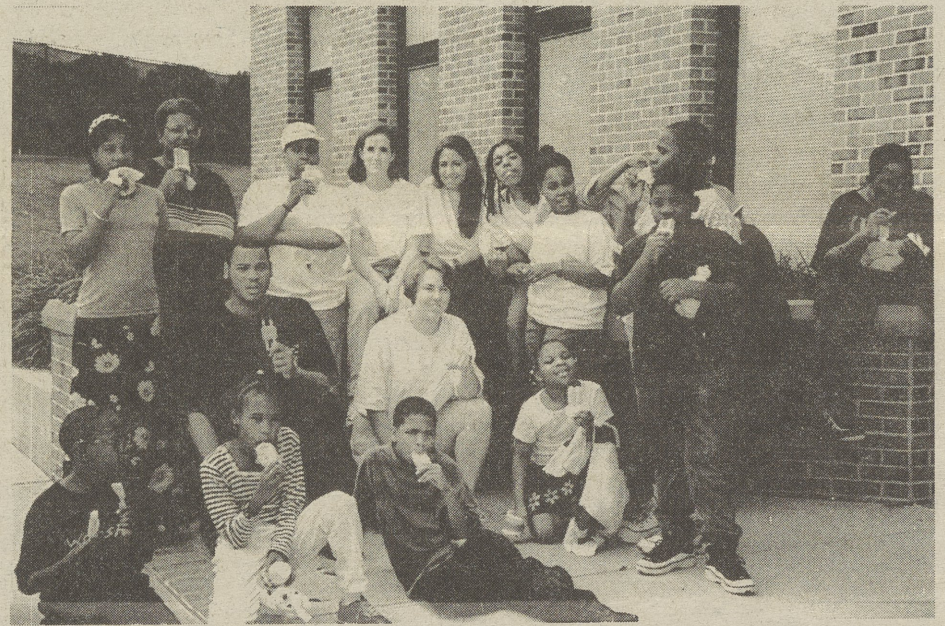
Delco students who worked with the summer CLASP program relax with their young friends on the last day of camp.

From energetic young children to the Penn Staters that helped them, Delco was hopping this summer.