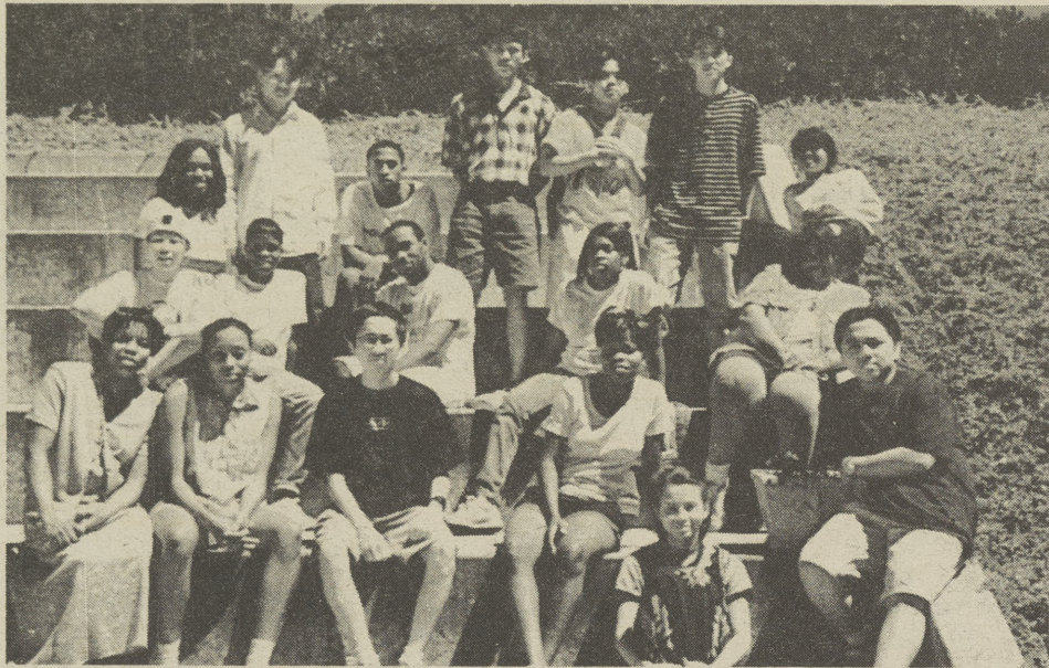
Students from the Bridge program take time out from the summer freshman orientation course to enjoy the sunshine.