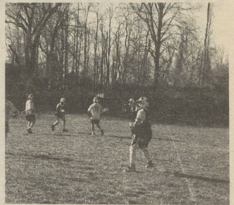
The lax team is given room to start a play that lead to pivotal goal in Delco's 11-8 victory vs. Temple in Men's Lacrosse.