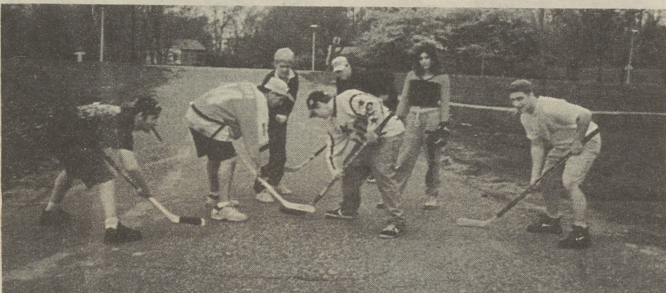
Intramural Hockey slaps off.

The tears that baptized the first words of this have now dried. It's 11:59 PM. Time to start a new day.....maybe even a new life.