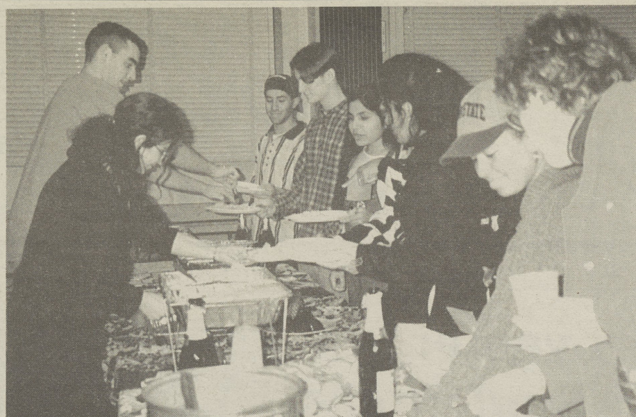
Students enjoy their own food after making their contributions to the homeless at the OXFAM Banquet.

This Ball is semi-formal, so ladies should wear dresses and gentlemen a tie and jacket.