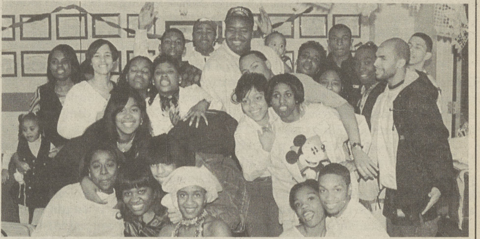
The African-American Food Fest, sponsored by the Black Student League, was full of food, fashion and fun; a complete celebration of African/African-American culture.