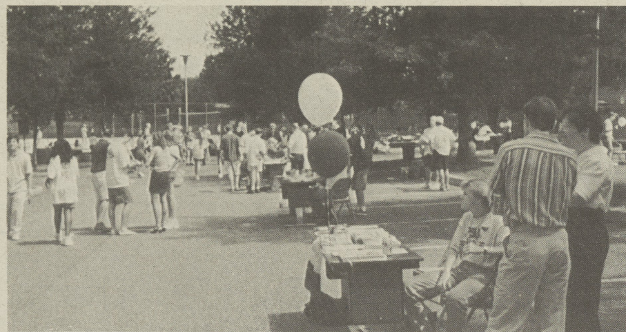
Many eager freshmen sign up for clubs on Orientation Day, as returning classmates and faculty assist.