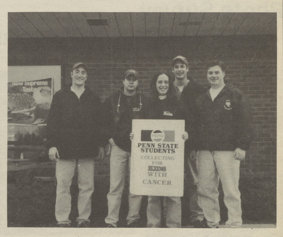
Alpha Sigma Phi members from University Park finish collecting money for the Four Diamonds Pediatric Cancer Fund at the Lima Burger King.