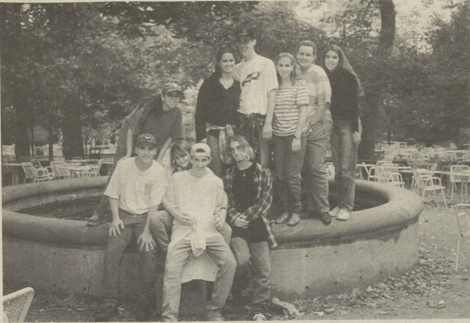
Delco Lions loose in the Philadelphia Zoo.