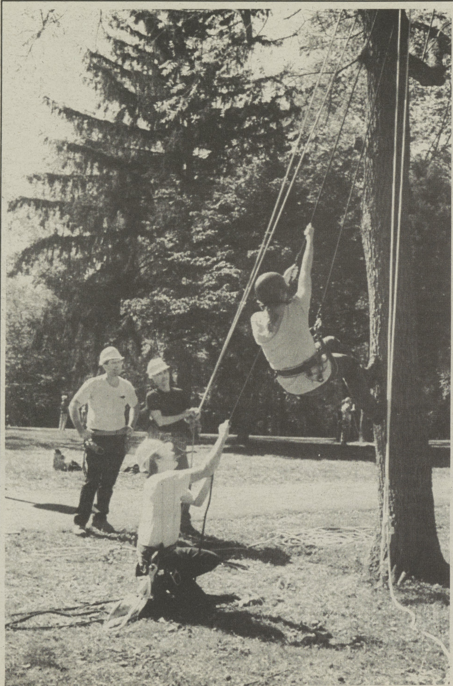
The University Extension Service is sending people here to train to become tree physicians. These tree climbers are sprouting up all over campus.