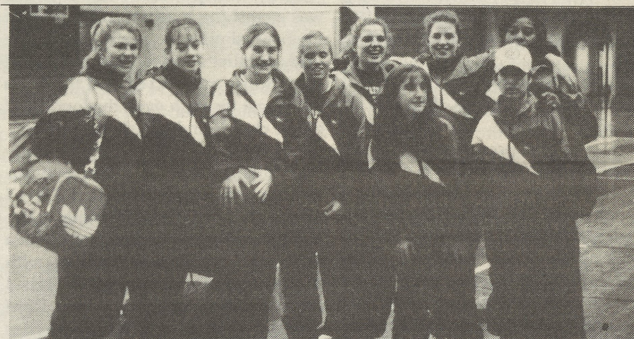
The women's basketball team flaunts their appearance at the championship at University Park.

If you are ever around the Iceland in West Chester, go check out our Lions.