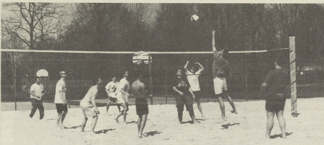
The grand re-opening of the new Beach Volleyball Courts featured hot dogs, sodas, side-outs, and "Hot dogs" again.