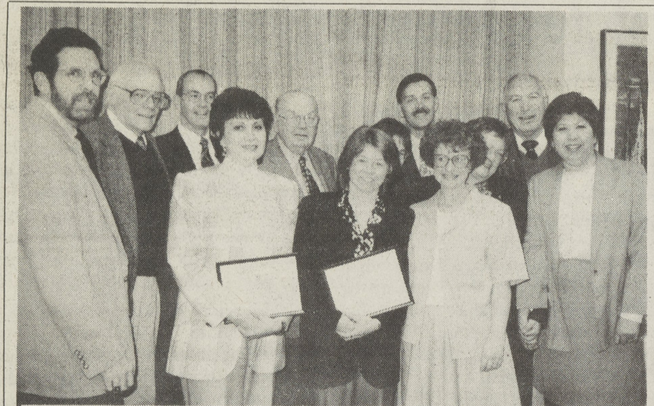
Adult Student Honorary Fraternity with advisors and present and past inductees.