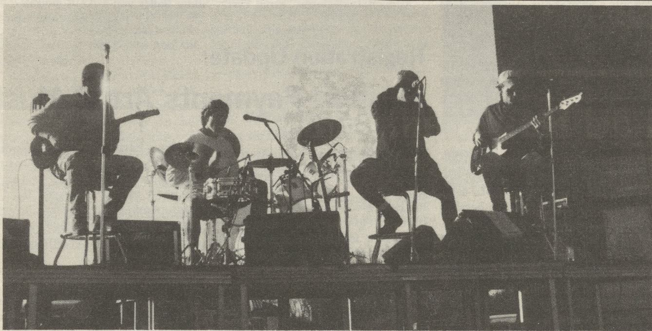
Battle of the Bands highlights Delco's Spring Week.