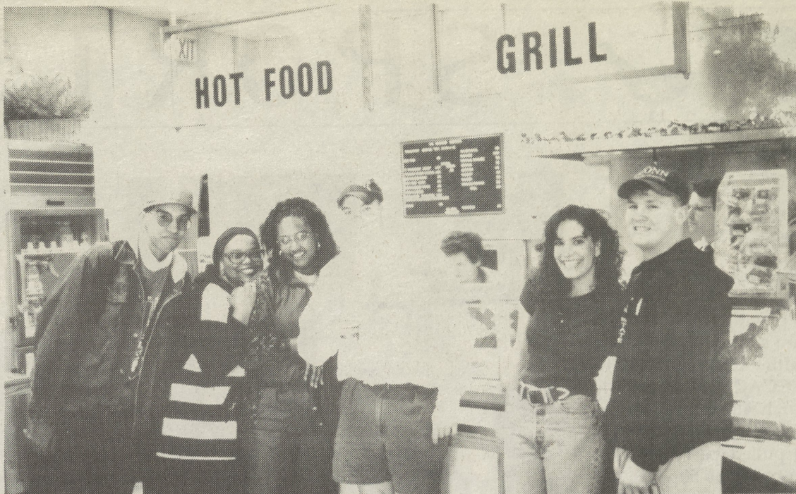
Happy, hungry students line up for lunch in the Common cafeteria.

There will also be a "skills competition" in addition to the actual game. The competition will consist of a slam dunk contest and a three point shooting contest. Prizes have not yet been announced, but it will be a great opportunity to come out and show everybody what kind of skills you have.