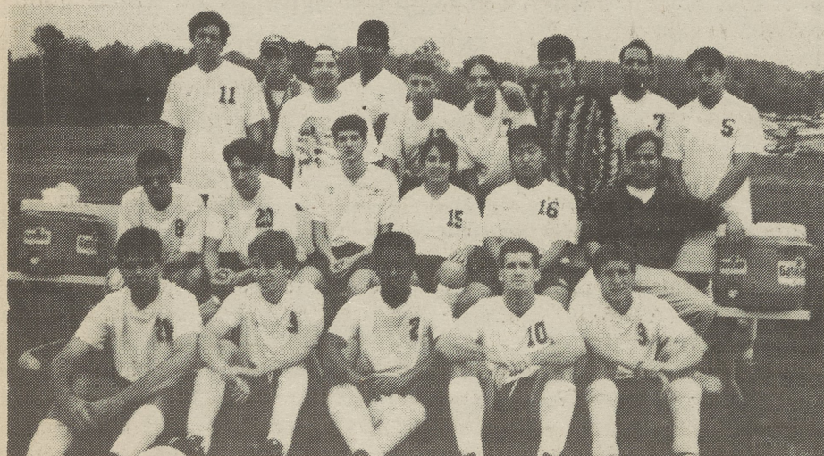
Delco Soccer Team is already looking ahead to next season.

In order for Delco men's basketball to win another victory, they need fans to come and support the team. Their opening game is scheduled for November 19, 1994.