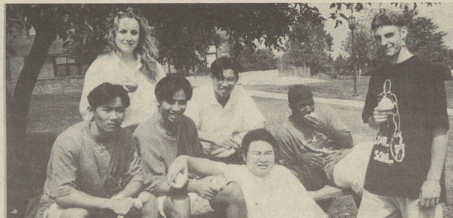
Delco students relax by eating apples from the campus orchard.