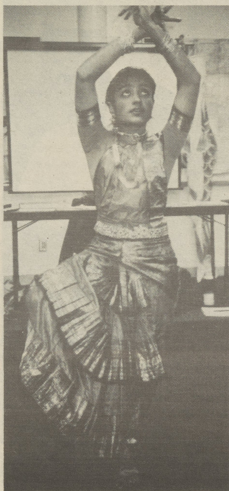
Indian dancer performs during the Cultures of Asia program.