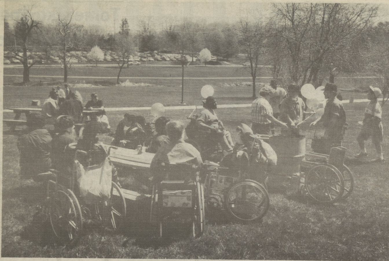
Kids at the Keystone Honor Society's pie throwing fundraiser.