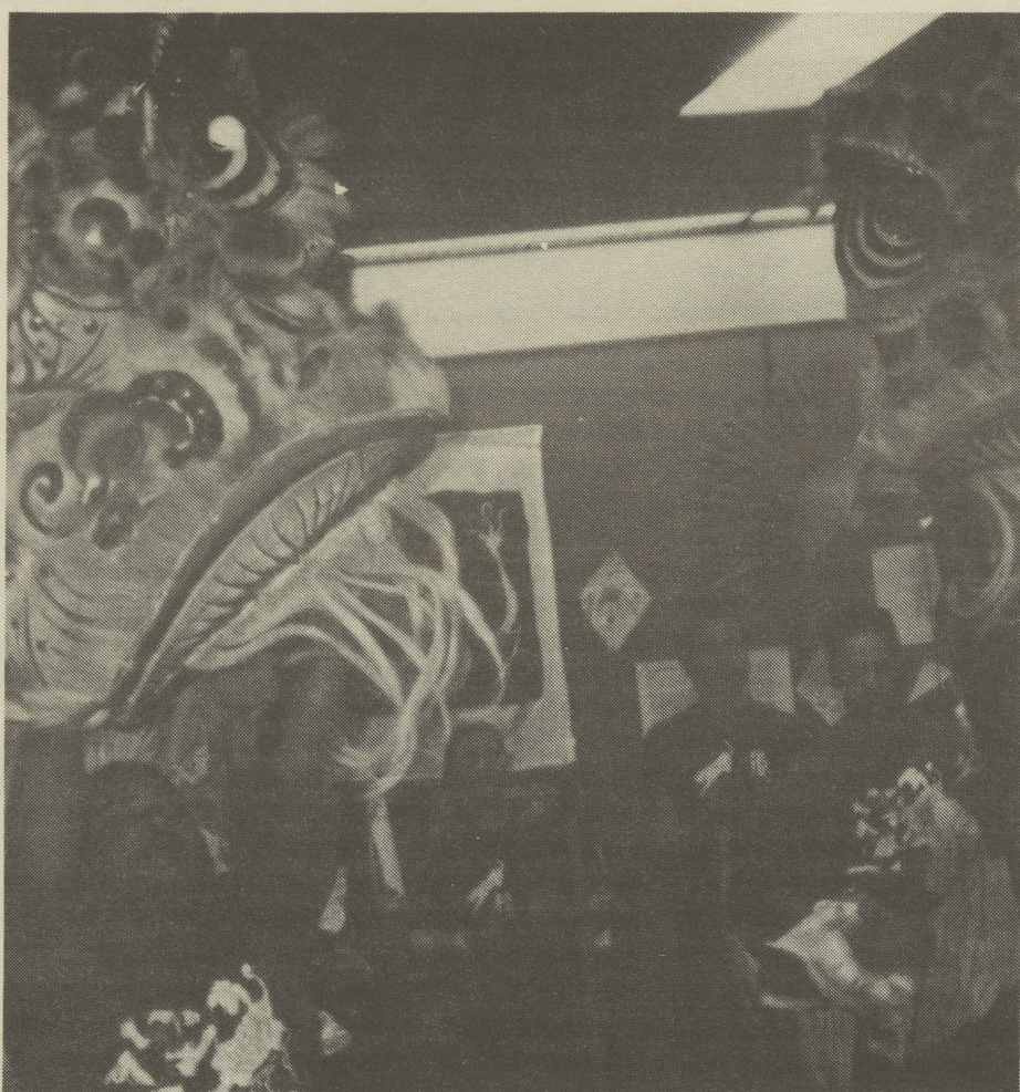
Chinese Lions do battle in Chinese New Year Lion Dance at Delco Library.