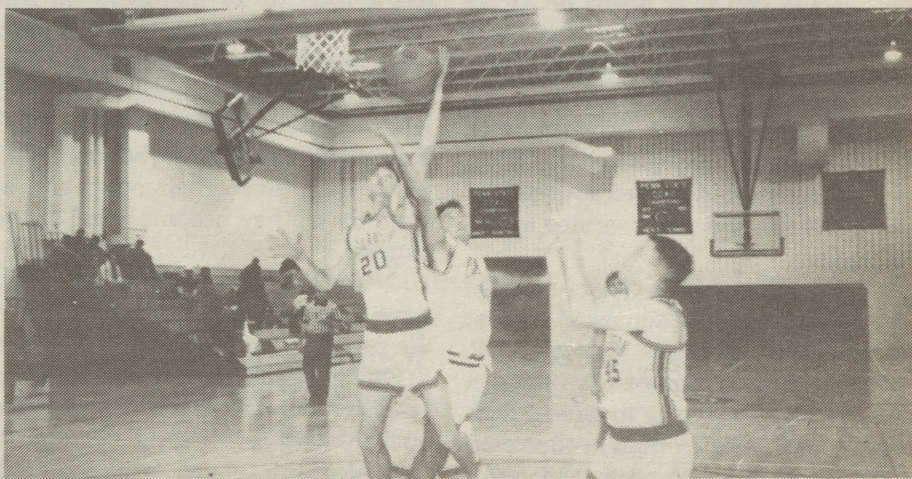
Penn State Delco Men's Basketball Team make it 28 straight regular season game wins.