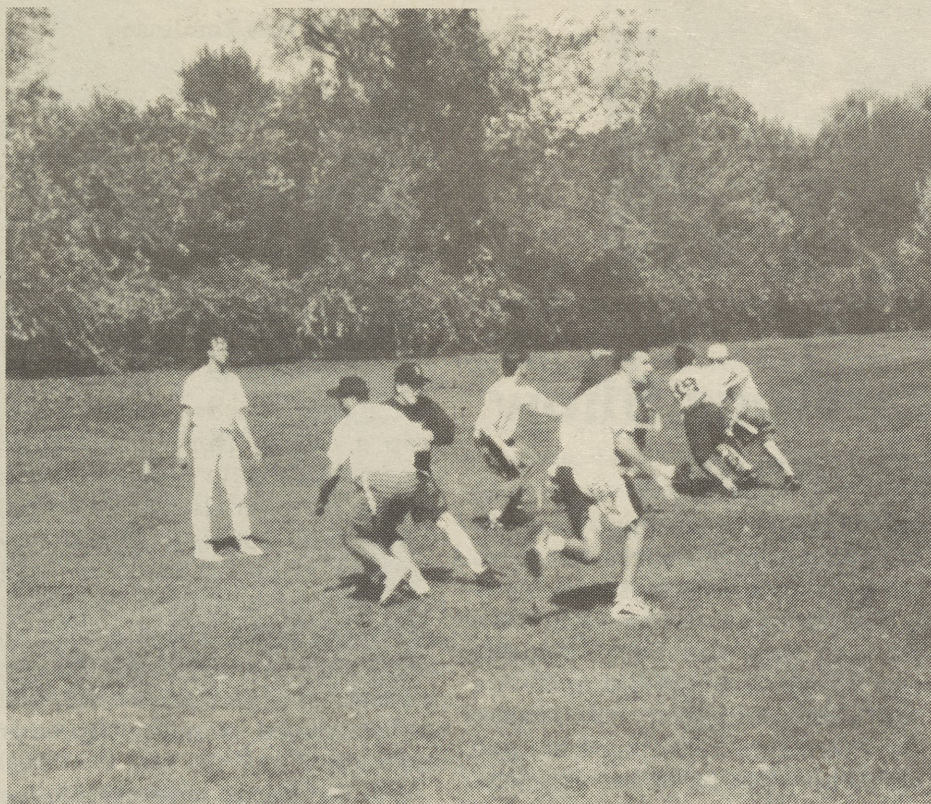
Intramural Flag Football draws a spirited turnout during Common Hour.

Answer: "e". Penn State will play in the Rose Bowl if they win the Big Ten.