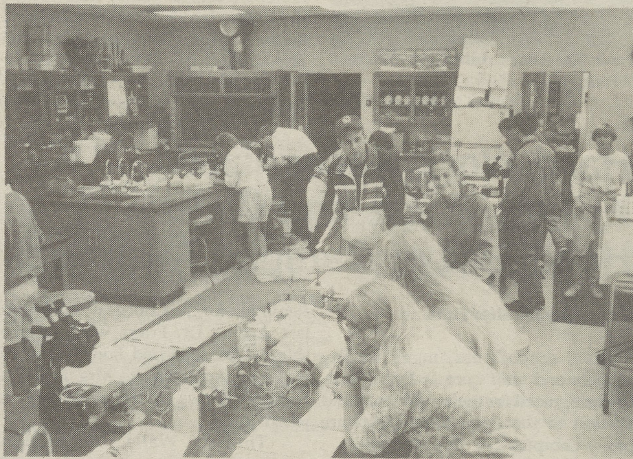
Students settle in for a full day of biology in a new course meeting Saturdays this semester.