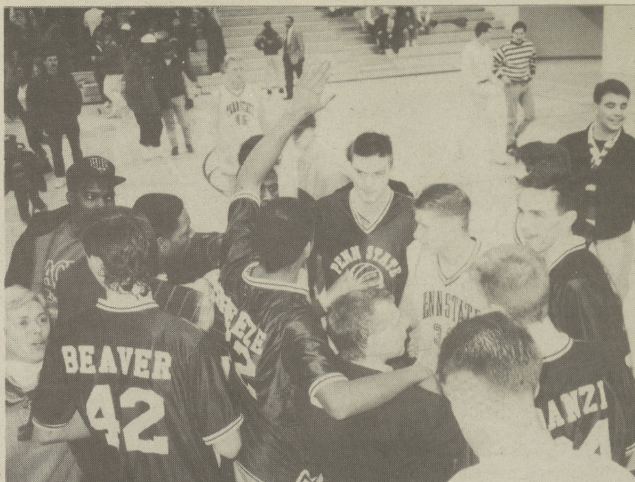
Delco's fabulous basketball team show team spirit after one of many winning games.