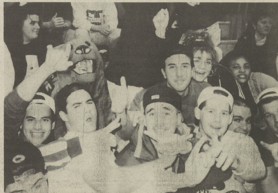
Delco students support their outstanding basketball team.

The winner heads to University Park to play the Western Regional winner for the Penn State Commonwealth Campus Championship.