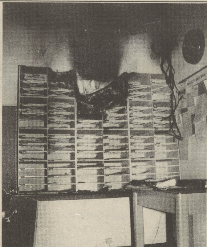
Portable heater unit causes a fire in the mailroom.

In closing, Mrs. Lindsay stated that, "Each voice is important. We must speak up against oppression. Until we do, it doesn't matter what our race, religion, or even sexual preference; we are agreeing, we are giving our silent consent. Dr. King wasn't only fighting for black equality, but equality for everyone."