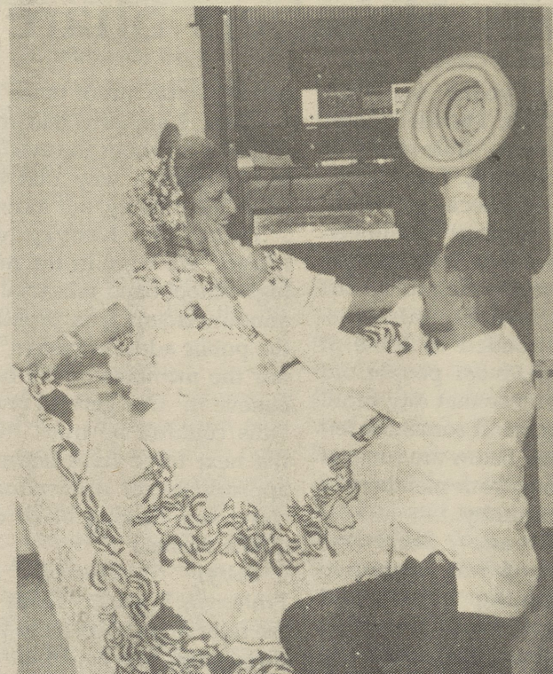
Anyone want to dance? These dancers were full of energy and enthusiasm during Hispanic Heritage Week.