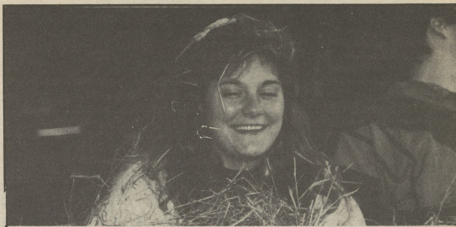
Does this Penn Stater look like she had fun on the hayride at Linvilla Orchards, or what?

free to attend. Watch the campus bulletin boards for details on the can food drive, as well at the sale of Candy-Cane-O-Grams.