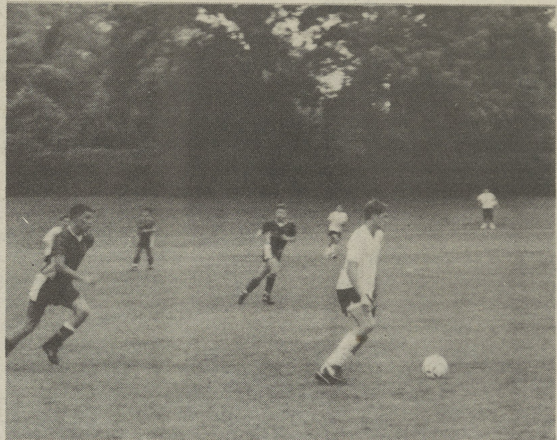
Kick that ball! Delco player rushes to score.

Clark after playing one game allowed only one goal. Goalkeeper Craig Sweeney averaged 2.6 goals per game.