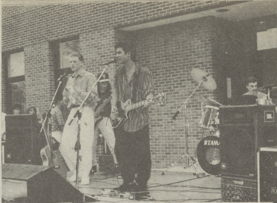
Spiral Blue entertained Penn Staters at the Welcome Back Picnic on Sept. 6th.