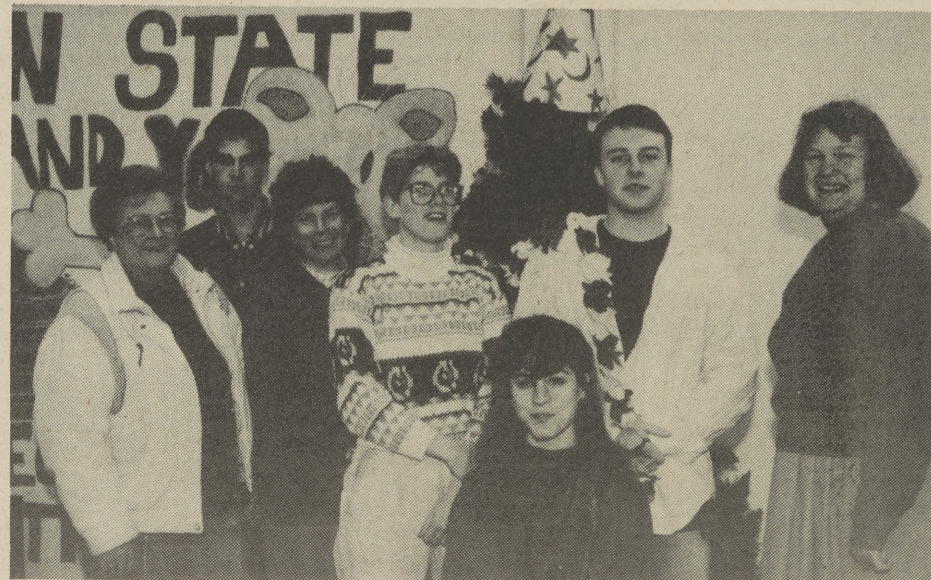
Students and faculty gather around the "St. Patrick's Day Tree" in the Lion's Den during the March 15 St. Patrick's Day Party.