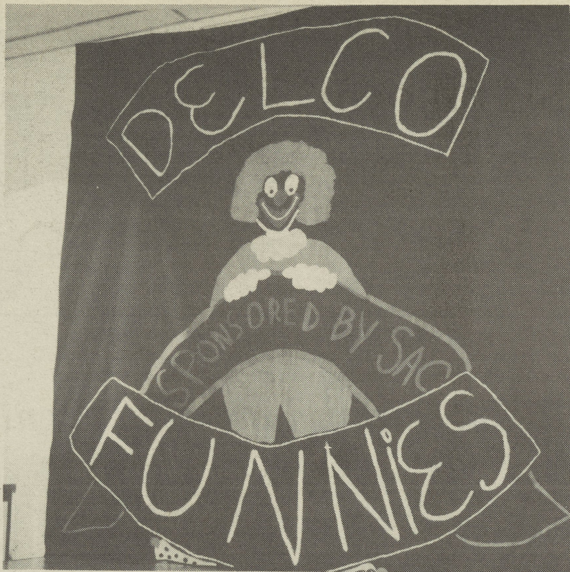
What's funny about Delco? Find out at the next Comedy Night on January 25.