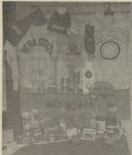
Check out the campus bookstore for a variety of great gift-giving ideas for holidays.