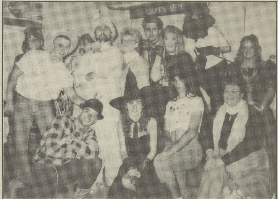
Who are these people?! Penn Staters decked out to show their secret selves at Penn State's Halloween party on October 26.