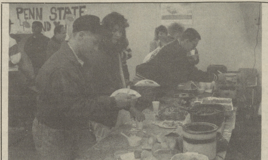
Delco students dig into a variety of tasty foods at the Ethnic Food Festival during Cultural Awareness Week.

Central American & South American Day Friday, November 9, 1990 12:30 PM - 1:20 PM (Room to be determined)