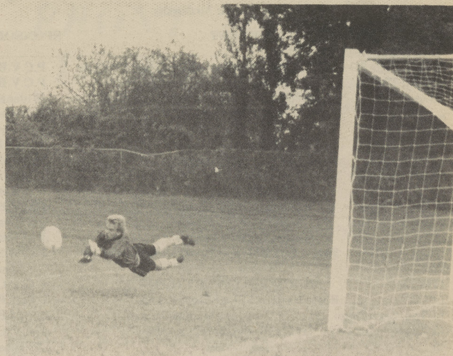
The goalie lunges to prevent a score at a recent Delco Soccer game.