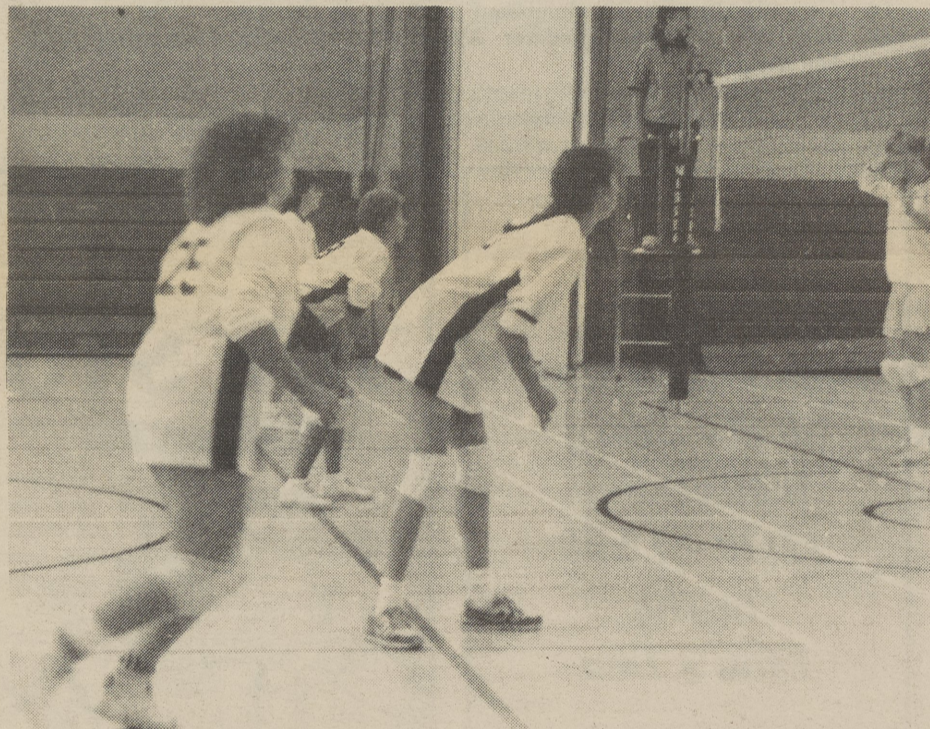
The Delco Lionesses show their winning form at a recent volleyball match.