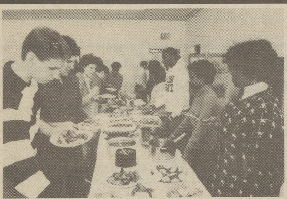
Members of the BSL working hard