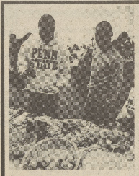
Happy BSL members chat while self serving