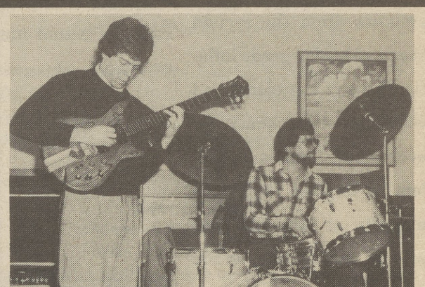
Third String, a jazz band, performed for the Black Student League of PSU Delco.