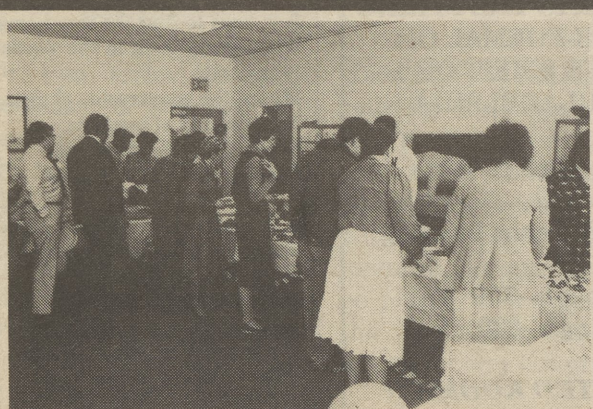
Staff members view the feast