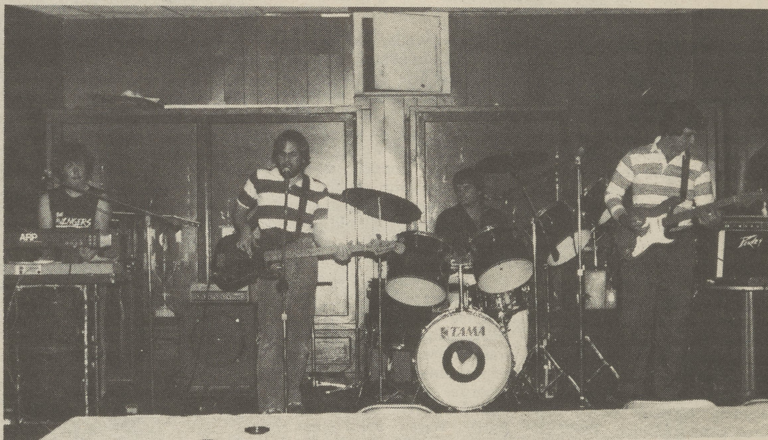
The Avengers: an up and coming rock band.

The list of credits on 'The Wild Heart' is quite impressive. Appearing are: Don Felder of Eagles fame, Roy Bittan of the E Street Band, Mick Fleetwood, and of course, Tom Petty. All in all this is a very beautiful album from a very beautiful lady.