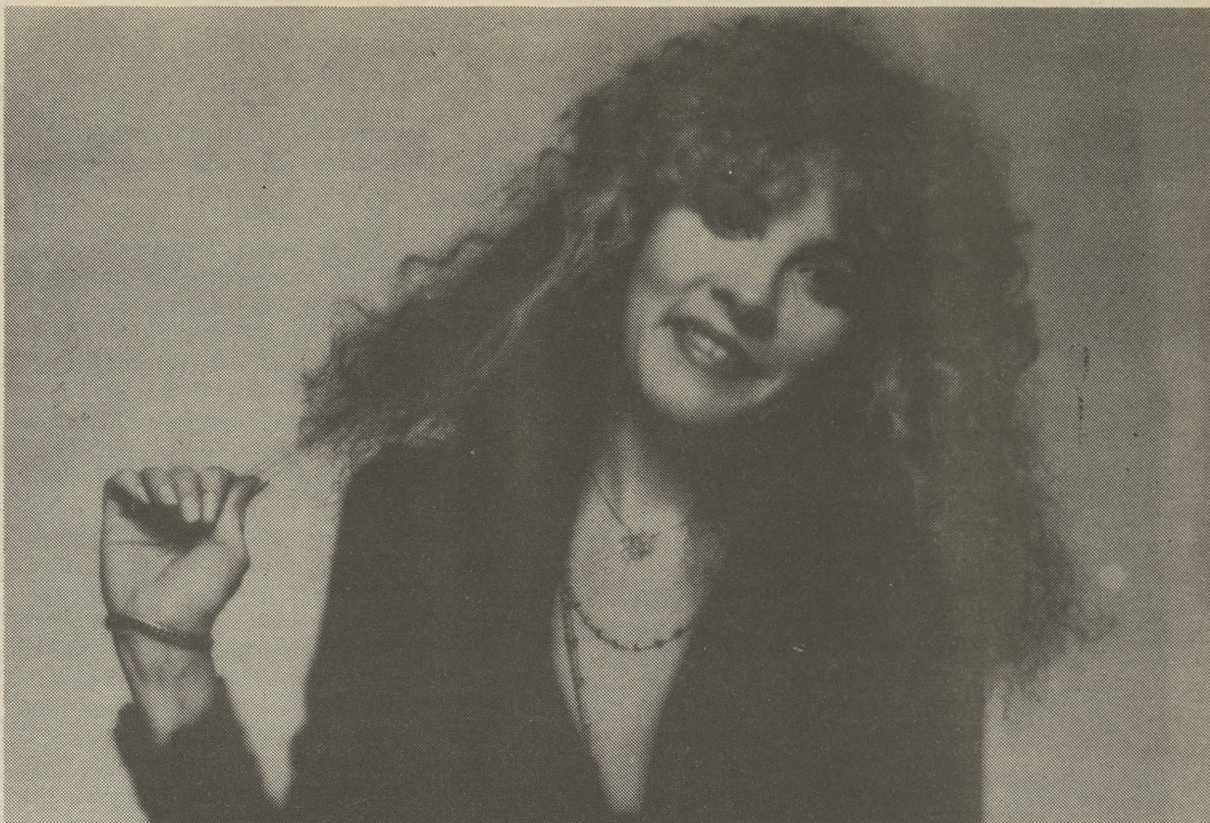
Gaining fame as a member of Fleetwood Mac recording star Stevie Nicks releases another solo attempt with "The Wild Heart."

It seems that Foghat really have their act together. They know what they want to do and they're having a good time doing it. By this time it was getting late, so I thanked them and bid them farewell.