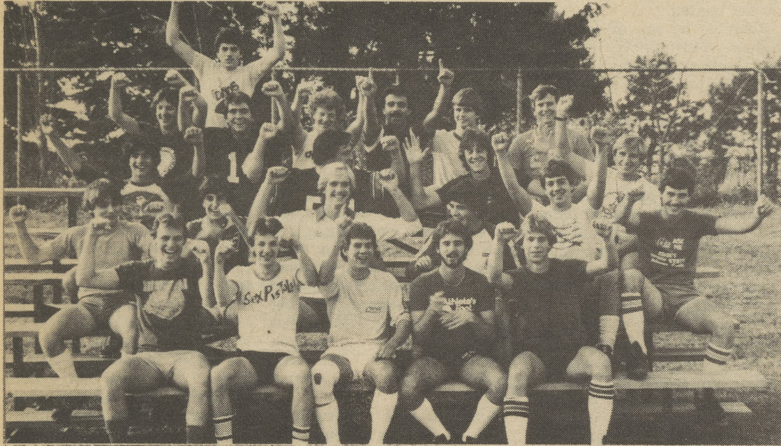
Delco soccer team: need we say more.

Although their opponents weren't from the major schools, Delco's Nittany Lions proved that they can handle anyone.