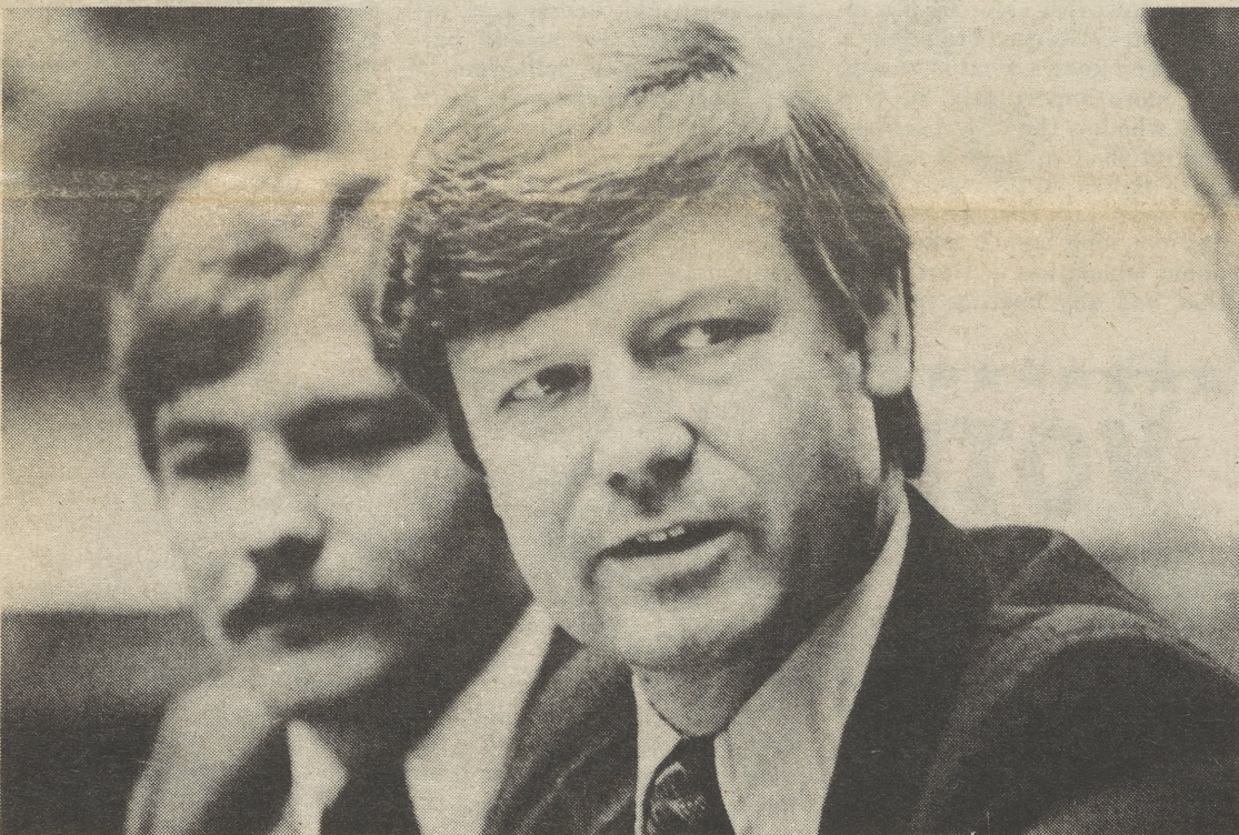
Congressman Robert Edgar (D)