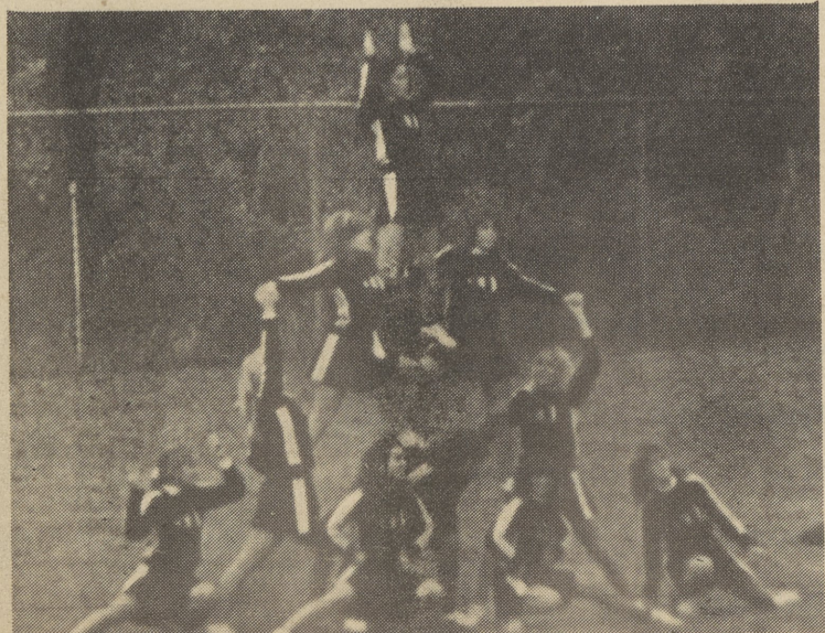
Penn State cheerleaders are getting up in the world.

Picture is worth a thousand, and this picture says it all.