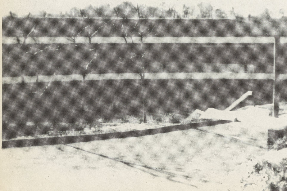
Library Learning Center

He is a graduate of Villanova University and he earned a master's degree in fuel technology and a Ph.D. in chemistry at Penn State. Prior to joining Penn State, he was a senior research chemist at Atlantic Richfield Company.